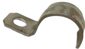
One Hole Straps