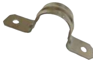
Two Hole Straps