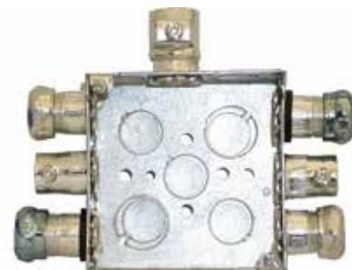
Wiring room using Space Saver Steel connectors