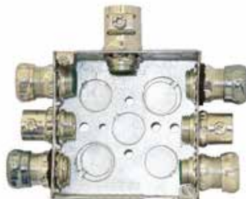
Wiring room using conventional steel connectors