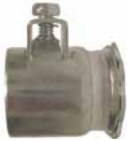
Steel Set Screw Space Saver Connectors