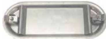
Form 7 Steel