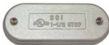
Gray Iron Cast Cover