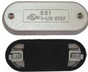
Gray Iron Cast Cover