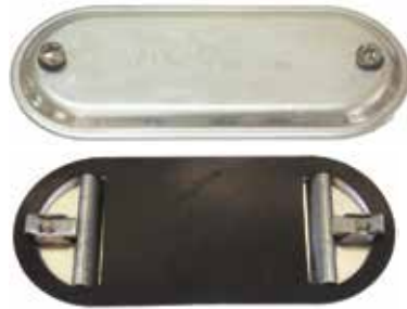
Cover and Gasket