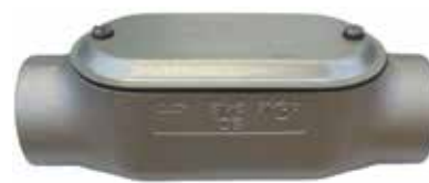
C-CGKON Cover & Gasket Included