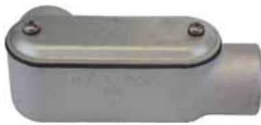
LL-CGKON Cover & Gasket Included