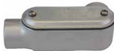
LR-CGKON Cover & Gasket Included